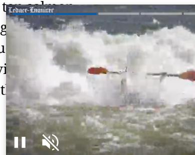
Video: Meet Phenix City sibling become world-class kayakers

SEARCH ONLINE: For one-day guided fishing trips look in Anchorage, Kenai, Dillingham and Seward. Find lodges and best salmon streams at “ten t streams,” at “salmon streams in Southeast Alaska,” at best fishing lodg Alaska,” and at “bear viewing in Southeast Alaska.” Related sites inclu crystalcreeklodge.com; alaskatravel.com; anchorage.net; alaska.gov/vi kenaipeninsula.org; flyrusts.com; skytrekkingalaska.com; and withint