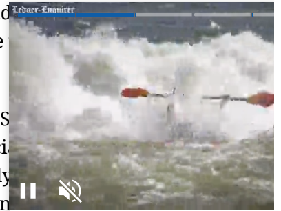
Video: Meet Phenix City sibling who became world-class kayakers

If you're a cruise ship passenger on a ship docking in Alaska, ask the Shore Excursion desk if they arrange half-day flights to one of Alaska's special viewing sites, often located nearby, in a state or federal park. These flights are expensive, but aerial views of Alaska are a once-in-a-lifetime experience. Over creeks and forests you can see everything: wolves and moose in the brush below, herds of caribou on the hills, swans on their nests and white bears cruising in ocean inlets. There's no doubt about it, flight seeing in Alaska is always better than any theme park.