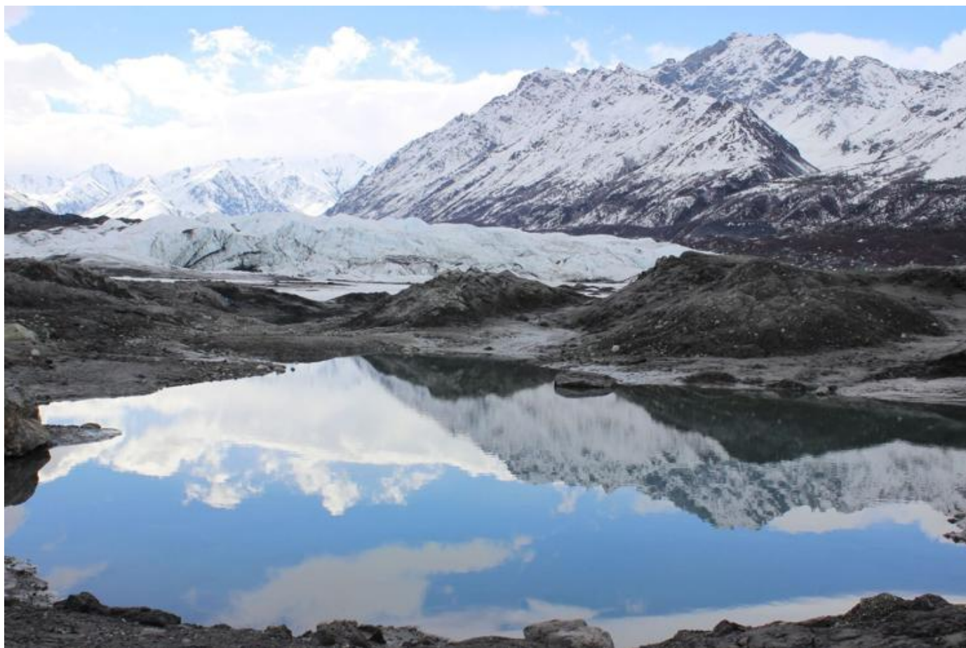
Picture of an iceberg with mountains in the background.