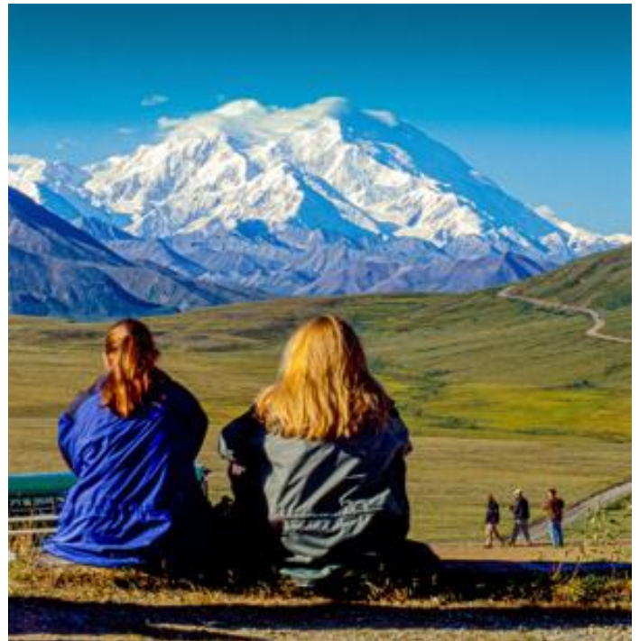
Amazing Denali, also known as Mount McKinley, its former official name, is the highest mountain peak in North America, with a summit elevation of 20,310 feet

Depending on the day, the Denali Star makes short stops in Wasilla, near Anchorage, or in Talkeeta. It may even