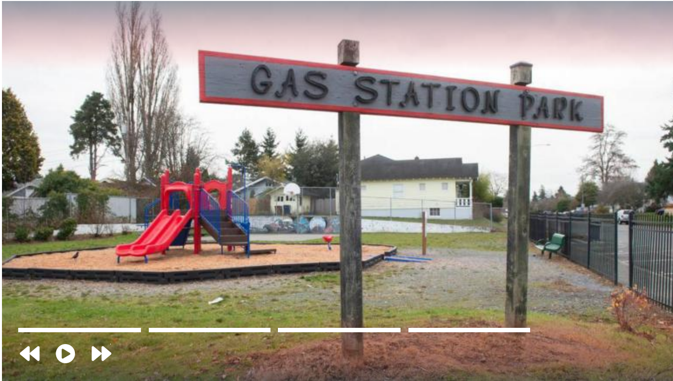
One of Tacoma's tiniest parks to get a new look in 2020

The who and why of cave art remains a mystery. But not in Lompoc, where the now-famous mural project was launched with a purpose, to revitalize the historic center and attract more