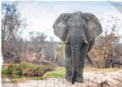
Size matters when two forces meet. Flapping ears mean back off and give this elephant space at the South Luangwa National Park.