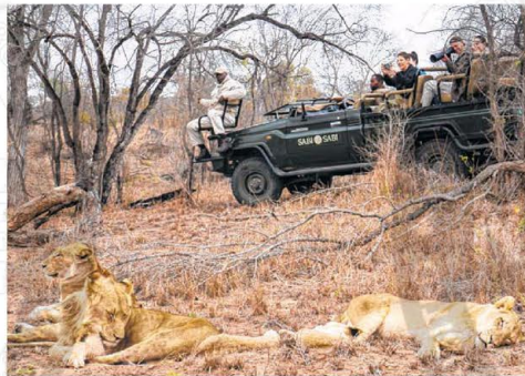
Expert trackers Lazarus and Louis find gold: a pride of lions sleeping off dinner near Earth Lodge.

The patio, with tables and chairs, flower beds and a fountain, was the gathering place. Our bedroom, one of seven tented cabins connected by swinging bridges,