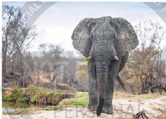
Size matters when two forces meet. Flapping ears mean back off and give this elephant space at the South Luangwa National Park.