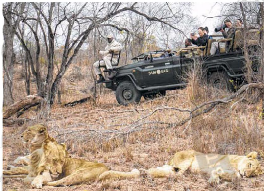
Expert trackers Lazarus and Louis find gold: a pride of lions sleeping off dinner near Earth Lodge.

The patio, with tables and chairs, flower beds and a fountain, was the gathering place. Our bedroom, one of seven tented cabins connected by swinging bridges,