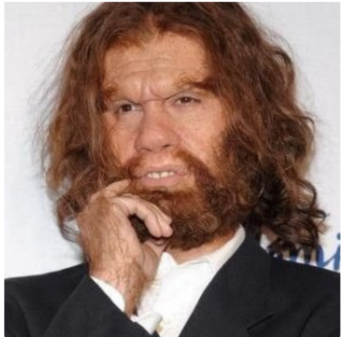
This GEICO Caveman is Gorgeous in Real Life