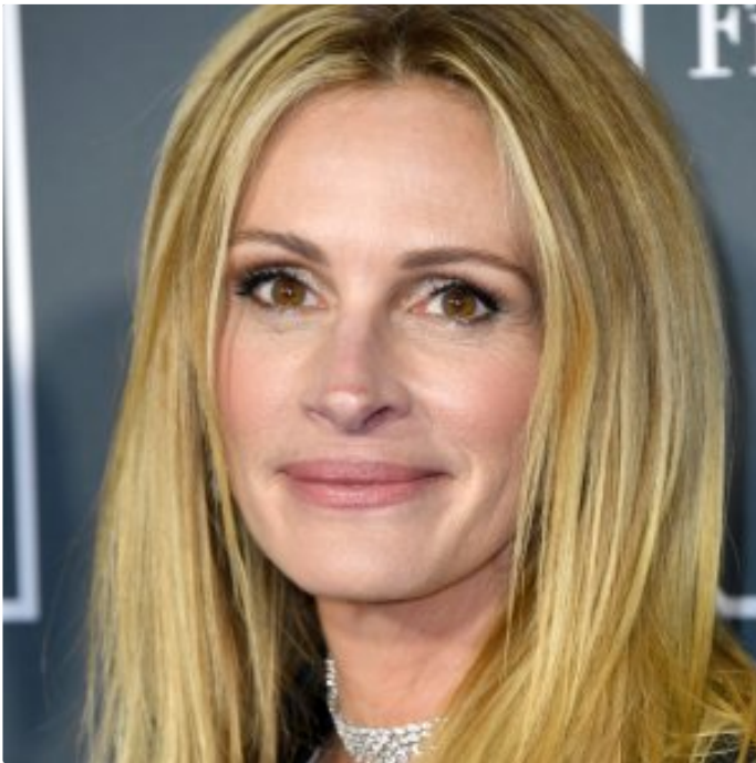
Julia Roberts Nails What May Be Saddest Part Of Admissions Scam