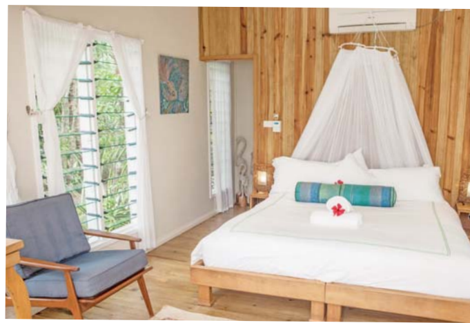
Cottages at the Sau Bay beach side cottages