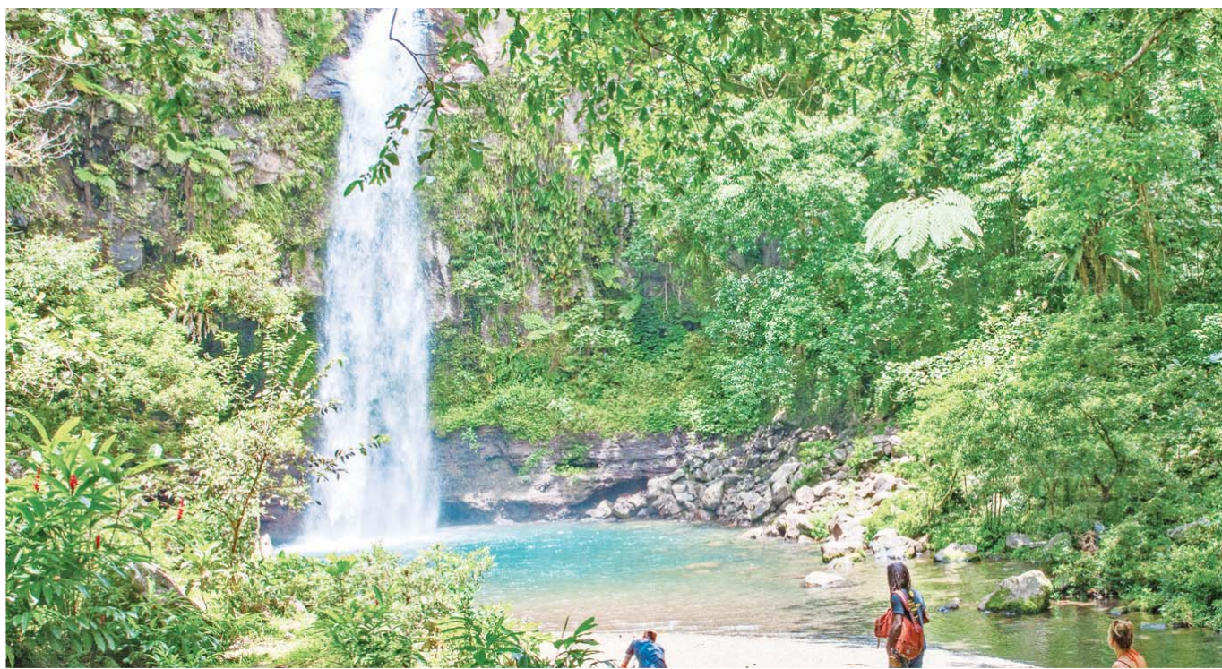
Tavoro Waterfalls in Bouma National Heritage Park in Fiji.