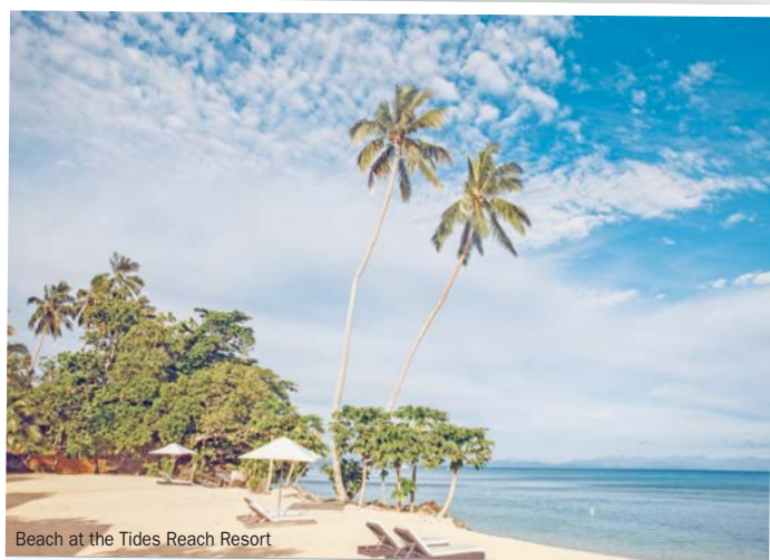
Beach at the Tides Reach Resort

Fiji a 333-island nation, I've got a pretty good idea why each destination promises a unique experience. What's the secret? It's the Fijians themselves, proud to be Fijian and proud to show you their country