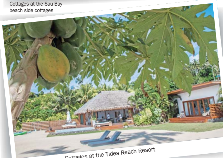
Cottages at the Tides Reach Resort