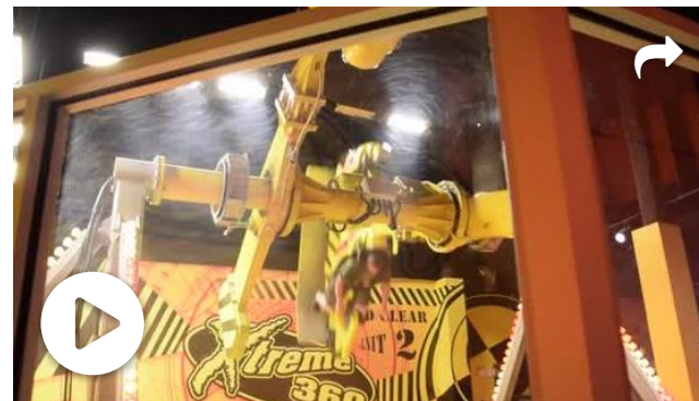
Explore WonderWorks at Broadway at the Beach