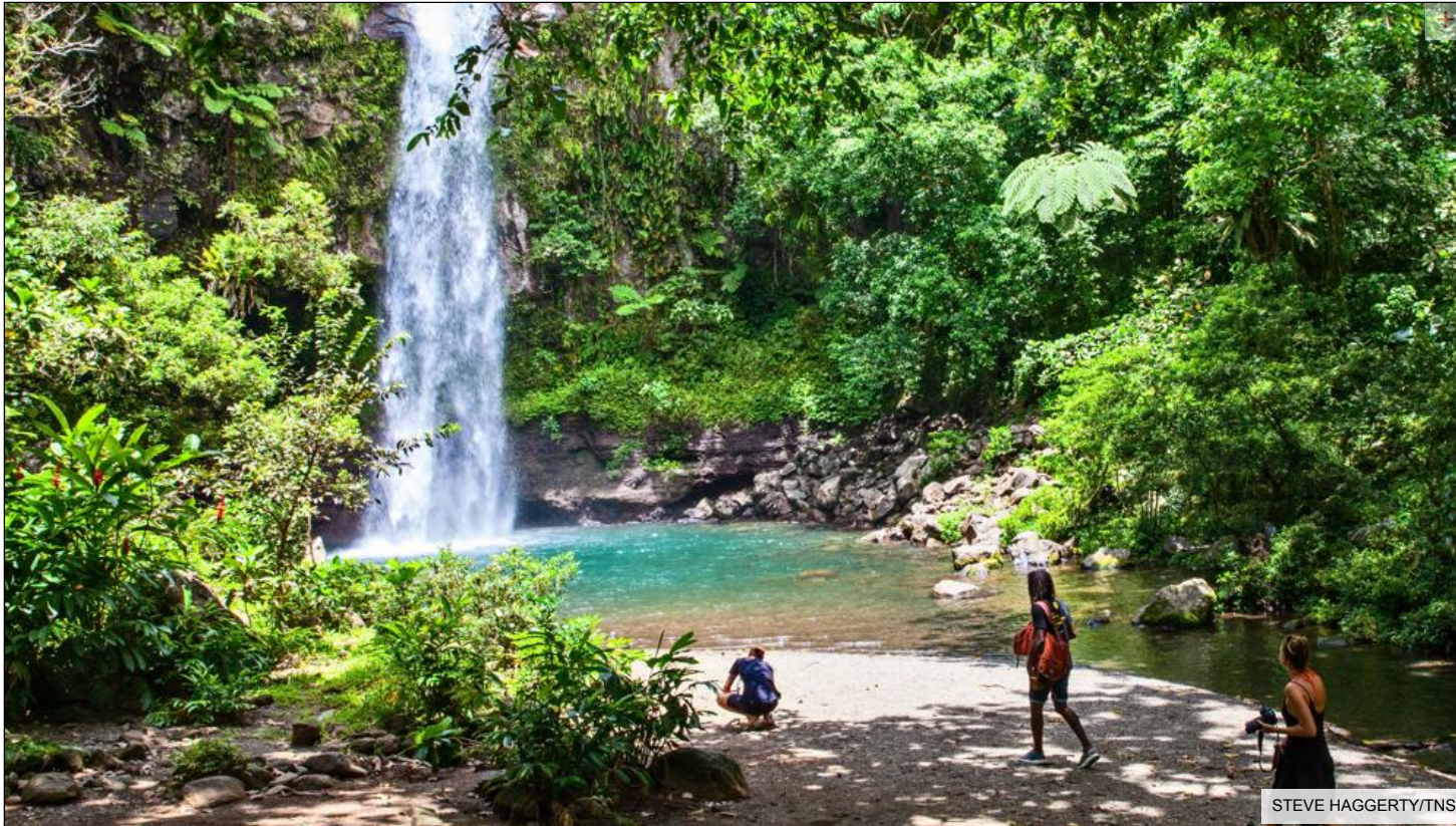
Tavoro Waterfalls, in Bouma National Heritage Park, is one of Taveuni's top attractions. A $15 U.S. entrance fee pays the adjacent ... Read More