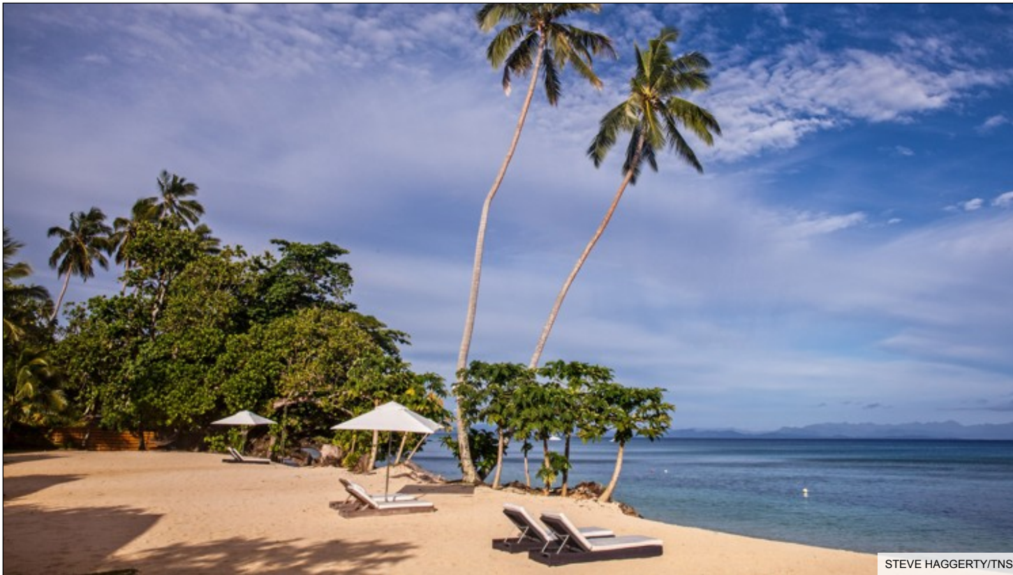
Sun pushes away wispy clouds above Beach Bungalow No. 1, at Tides Reach Resort, on Taveuni, Fiji's Garden Isle.

Posted: 6:00 a.m. Wednesday, February 14, 2018