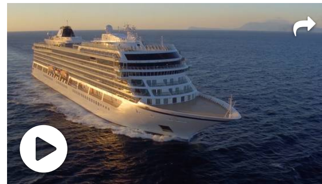
Viking Ocean Cruises set sail from Miami