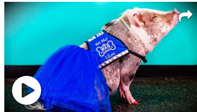
When pigs (help you) fly! Meet Lilou, the first known airport therapy pig