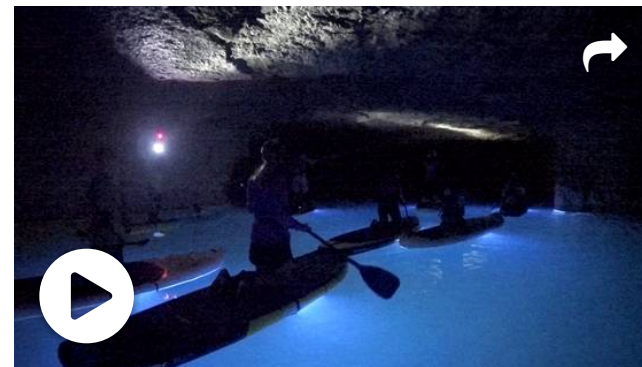
Go paddleboarding in a flooded Kentucky mine