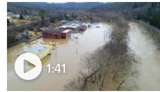
Aerial views show destruction from Eastern Kentucky floods