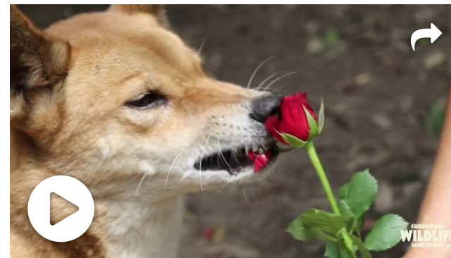
These zoo animals are baffled by Valentine's Day roses