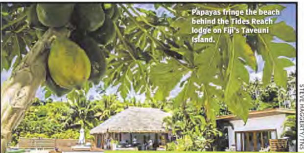
Papayas fringe the beach behind the Tides Reach lodge on Fiji's Taveuni Island.

Prices are per person. Cruise only on select sailings. Certain restrictions apply. Gov't taxes and fees are additional. Prices include NCP's. Prices are quoted in US dollars. All itineraries and prices are current at time of printing and are subject to change without notice. All exclusive deals are per cabin on select ships and sail dates and are not redeemable for cash. Ship's Registry: The Bahamas and Panama. GST #R015595-50 / Lowest Price Guarantee. In order to qualify for the guarantee the competitor's rate that appears in the advertising must be available for booking and be on the identical Cruise-only product (Ship, Date, Destination, Category, etc.) The customer must meet the requirements for any rules that apply from the cruise line in offering the rate. The guarantee does not apply to air, land components, onboard charges etc. This offer is only valid on cruise lines that are members of DLA.