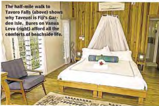
The half-mile walk to Tavoro Falls (above) shows why Taveuni is Fiji's Garden Isle. Bures on Vanua Levu (right) afford all the comforts of beachside life.