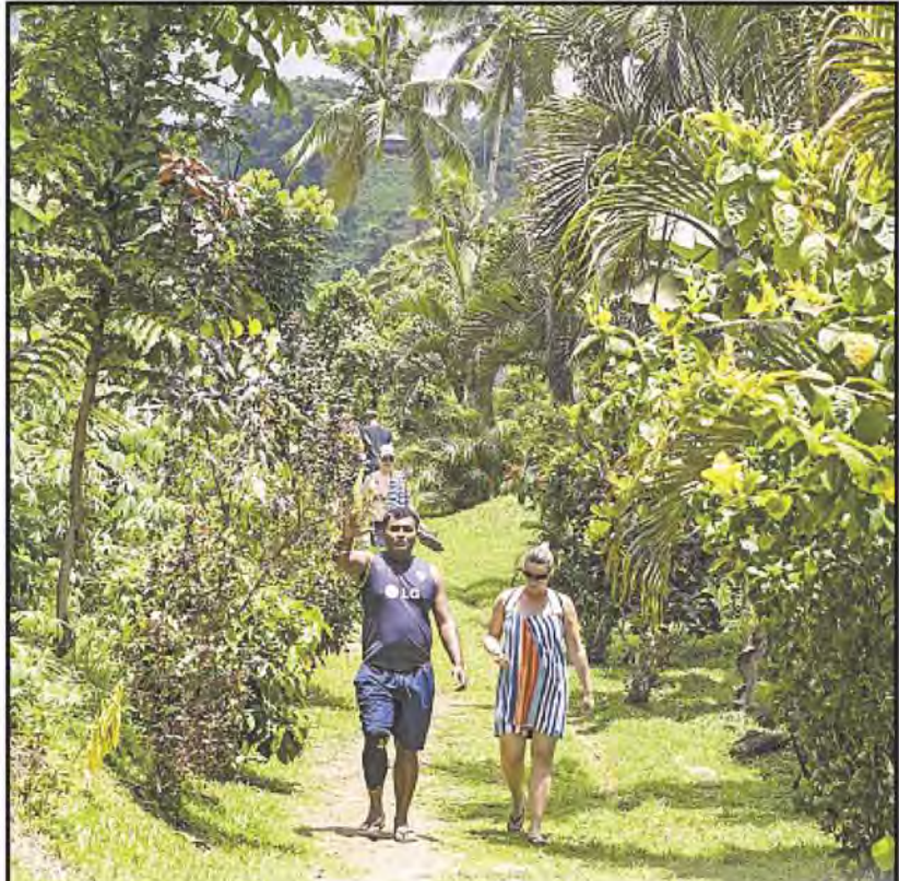
Continued from previous page

HARRY POTTER characters, names and related indicia are © & TM Warner Bros. Entertainment Inc. Harry Potter Publishing Rights © 2017. *Based on double adult occupancy for a 5-night stay at the Swan Inn International, book by 2/20/18 for select travel dates - 2/27/2018. Restrictions and blackout dates apply. A Night Movement Required. *Savings based on travel dates of the Splash, Stay and Play vacation package from Universal Parks & Resorts Vacations. Valid on new bookings only. One offer per package, not valid with other discounts or promotions. Void where prohibited. Restrictions apply. Universal Parks & Resorts Vacations is registered with the State of Florida as a seller of travel. Registration number 07-24215. Universal elements and all related indicia TM & © 2018 Universal Studios. All rights reserved. See website for complete details. 180218048