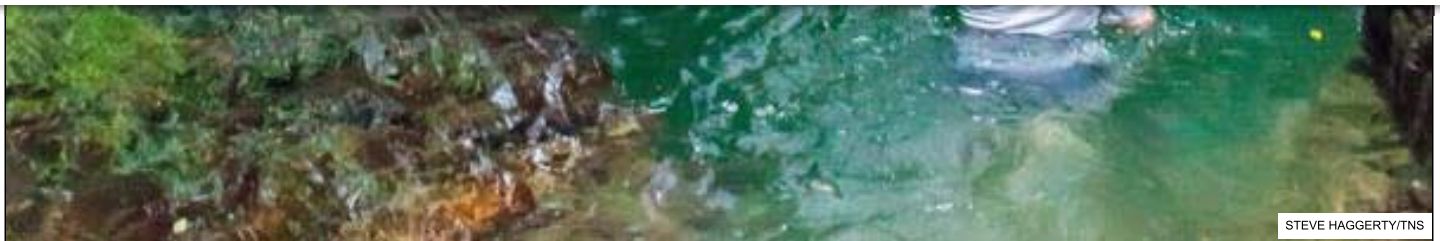
A half-hour's hike from Pacuare Lodge leads to a hidden waterfall.

No wildlife conversation lasted more than 10 minutes before the topic turned to Costa Rica's many species, and how they have adapted to the country's 12 climate zones, each at a different altitude, from sea level to the summit of frosty, 12,533-foot Cerro Chirripo Volcano.