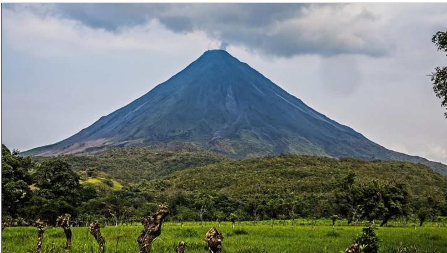
Arenal Volcano's unexpected 2010 eruption reminded observers that Central Costa Rica's most iconic feature can be unpredictable.

Posted: 6:00 a.m. Friday, January 05, 2018