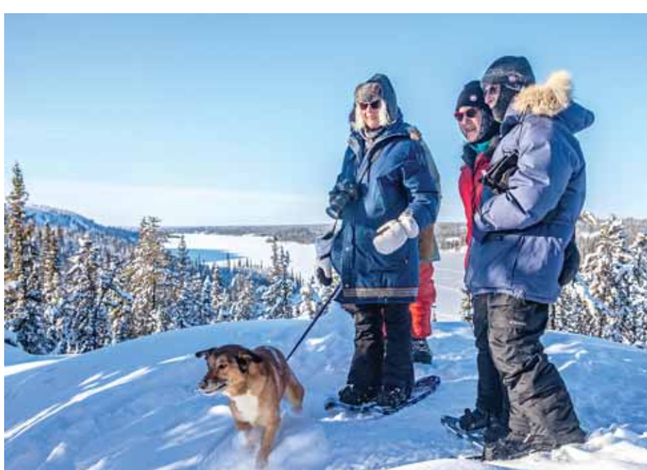
Pete the dog smells a rabbit, but the cliff is steep. The solution: back on the leash, just in case

The lodge is open in summer and winter, as long as the ski-float plane is able to land, on solid ice or open water. Each of the five rooms and five cabins at Blachford Lake \, Lodge is outfitted to sleep four or more, in king, gueen and/or bunk beds. Child rates are available, depending on the season and dates. All rates include excellent cuisine served buffet-style; two chefs prepare everything on site, from breads to salads and main dishes. Summer activities include kayaking, canoeing, swimming and hiking. Plan to take a commercial flight to Yellowknife and spend your first night there. For details and suggestions, go to www.blachfordlakelodge.com