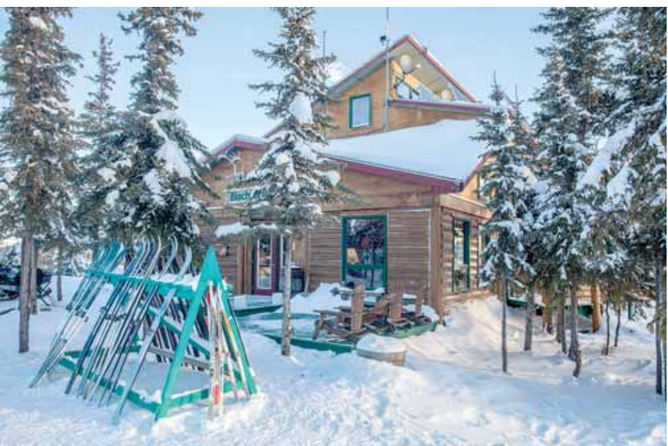
Power from solar panels, a wind turbine, five sets of batteries and a generator makes the lodge self-