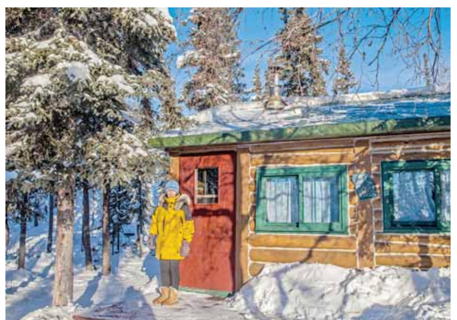
Guests in Raven's Roost cabin, which sleeps four, feel like pioneers, but warmer and more comfortable.