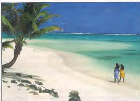
Rarotonga's peaceful lagoon

I figured we’d start our first day cooling off in the lagoon, and maybe “snorkel near the outer reef, where the coral clumps into mounds.” But my contact in the tourist office had a request. So before hitting the water, we visited marine environmentalist