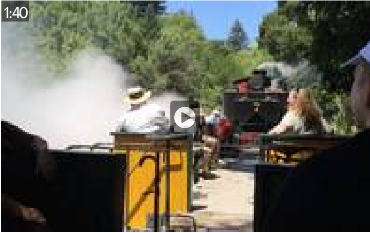
Ride along on a steam train through the redwood forest