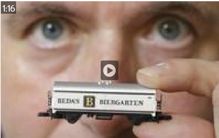
See the world's largest collection of miniature model trains