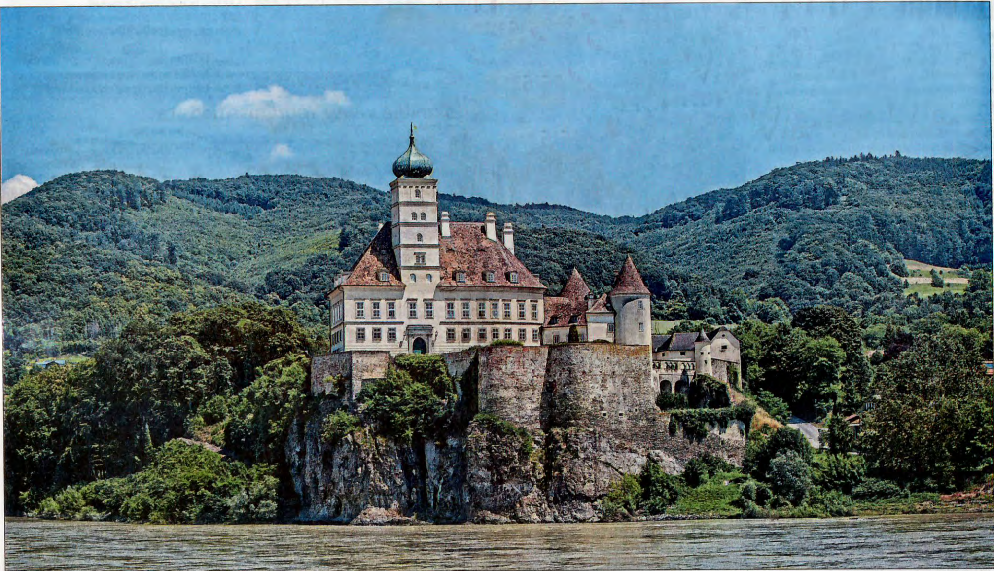
A classic cliff-side pile overlooking a slight bend in the Danube, this castle, not far from the 18th Century Benedictine Abbey and Library at Melk, was identified by the ship's crew as Schonbuhel Schloss.