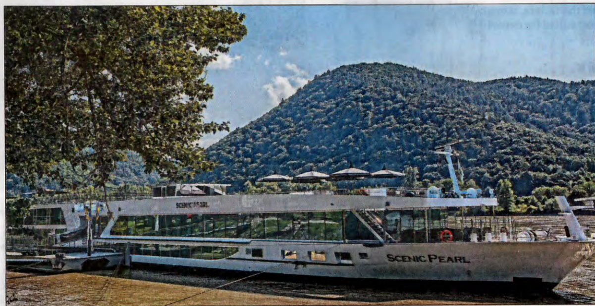
The Scenic Pearl, seen here at the dock where the Danube River makes a tight S-curve, at the village of Durnstein, Austria, a 10-minute walk uphill.

"He gave a talk our first night, but after that noth-