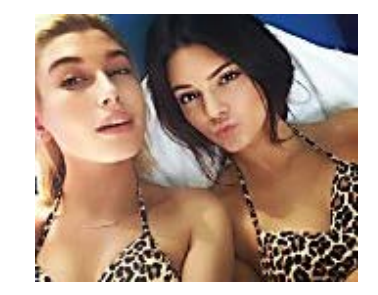
Twinning: Stars who got matching tattoos