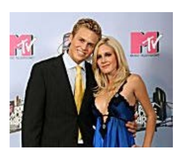
10 of reality TV's most notorious couples