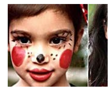
The best celebrity TBT Halloween costumes