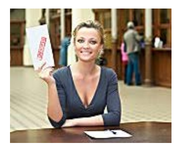
Pay Off Your House At A Furious Pace If You've