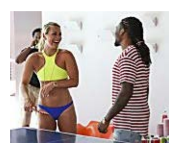
Lindsey Vonn threw a huge ESPYs pool party