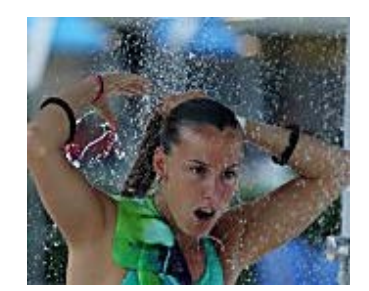
Why do Olympic divers shower right after getting