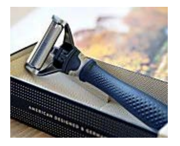
Meet The Razor Taking The Internet By Storm -