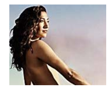
Athletes show off bodies in ESPN's 2016 'Body