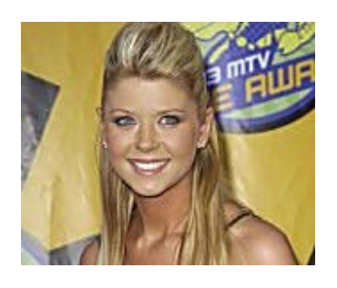
What happened to these former Hollywood 'it'