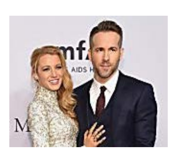
Age is just a number for these celebrity lovebirds