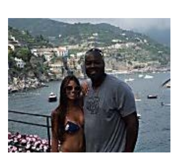
Ex-NBA star Glen Rice claims he's nearly broke