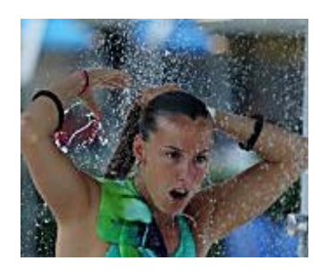
Why do Olympic divers shower right after getting