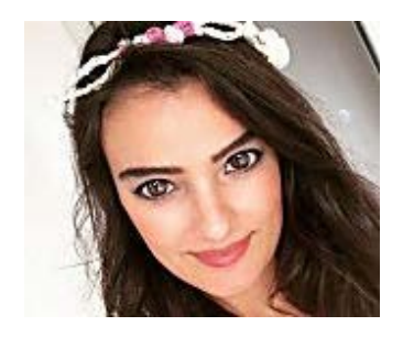
Former Miss Turkey sentenced to 14 months in prison for Instagra...