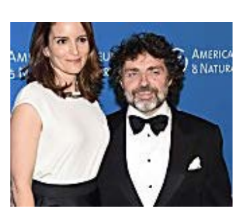
29 stars who married ordinary people CelebChatter