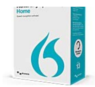
Dragon Home Digital Download