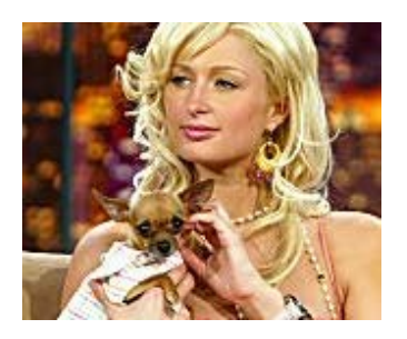
What happened to these former Hollywood 'it'