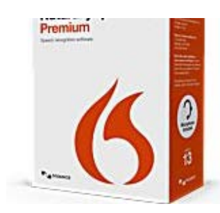
Dragon Premium $174.99 - nuance.com