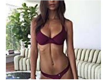
The 'ab crack' is newest body trend to spark social media outrage OddChatter

Dragon Anywhere Free Trial $0 - nuance.com