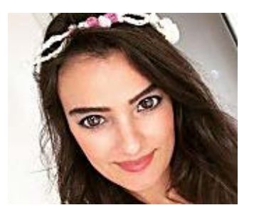
Former Miss Turkey sentenced to 14 months in prison for Instagra... OddChatter