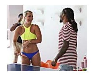
Lindsey Vonn threw a huge ESPYs pool party SportsChatter