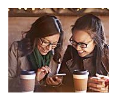
Read the Definitive Guide to Social, Mobile Customer Service