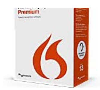
Dragon Premium Digital Download