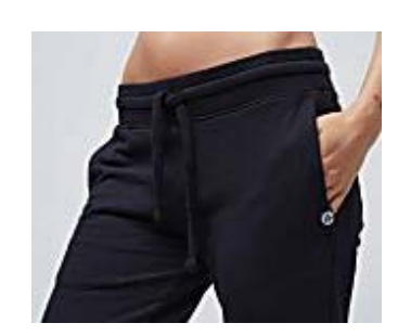
Forget Yoga Pants -These Are What You Should Be Wearing Th...