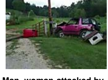
Man, woman attacked by bees after DUI crash OddChatter