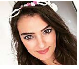
Former Miss Turkey sentenced to 14 months in prison for Instagra... OddChatter