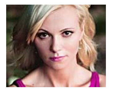
Police track down wanted vegan restaurant owner after... OddChatter