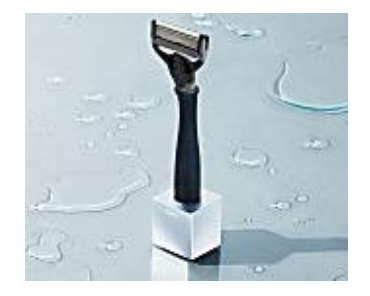
Why This Razor Is Causing So Many Guys To Switch Harry's