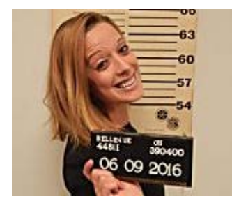
Women show off in mugshots after assaulting McDonald'... OddChatter