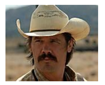
Movies that got Southern culture right CelebChatter