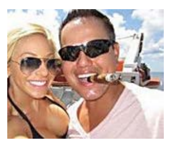
Television reporters charged with child abuse after their baby ...