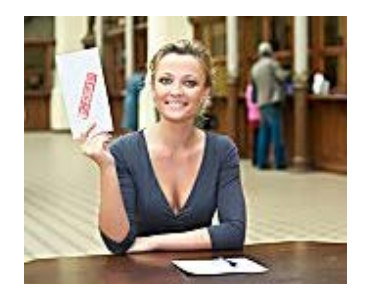
Pay Off Your House At A Furious Pace If You've Not Missed A Paymen...