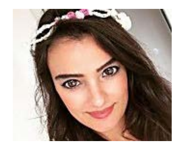
Former Miss Turkey sentenced to 14 months in prison for Instagra...