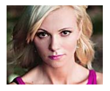
Police track down wanted vegan restaurant owner after... OddChatter