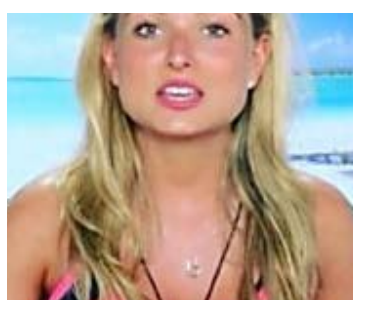
Miss Great Britain loses crown for having sex on reality show OddChatter