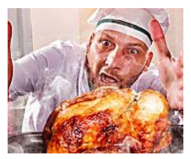
You'd Never Believe How Easy it is to Save Thousands when Fixi... Top 10 Best Home Warranty