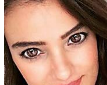
Former Miss Turkey sentenced to 14 months in prison for Instagram OddChatter