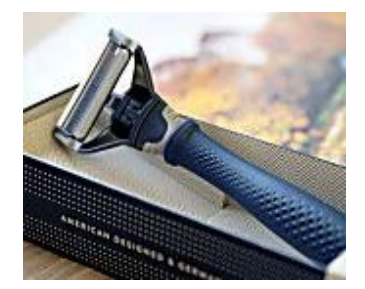
Why This Razor Is Causing So Many Guys To Switch Harry's