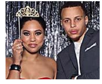
37 ways Stephen and Ayesha Curry are the perfect couple SportsChatter