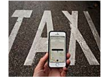
Uber, Airbnb, gig economy spurs growth and controversy PoliticsChatter