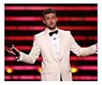
Going once, going twice: The weirdest celebrity items sold at auction CelebChatter