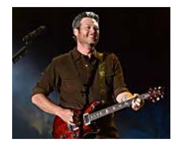
Country musicians that made the jump to mainstream stardom CelebChatter