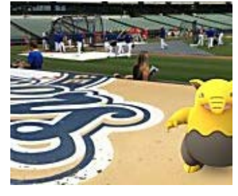
Pokemon Go is taking over, including the sports world SportsChatter