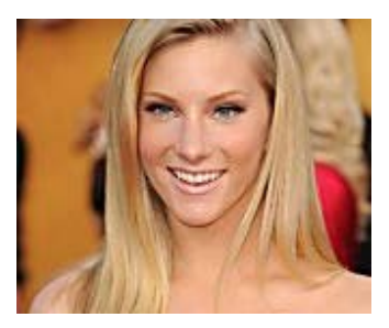
The most successful alumni of 'So You Think You Can Dance' CelebChatter