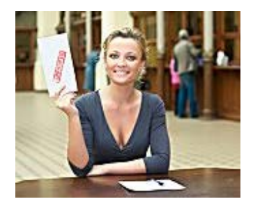
If You Owe Less Than $300k, Use Obama's Once-In-A-Lifetime Mo... LowerMyBills