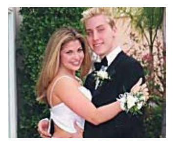
Oh what a night: Stars share prom pictures CelebChatter