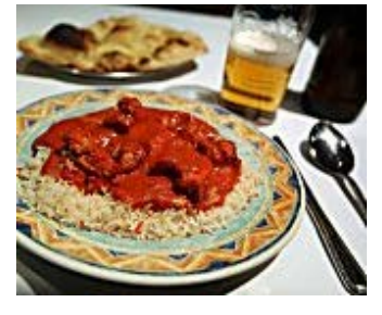
Restaurant owner sentenced to six years in prison after curry di... OddChatter