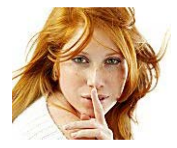
10 Online Dating Sites That Really Work Top 10 Online Dating Sites