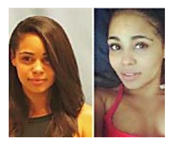
Arrested people continue to go viral because of attractiven... OddChatter