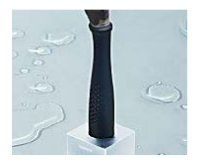
This Razor Is So Popular It Sold Out Twice Harry's