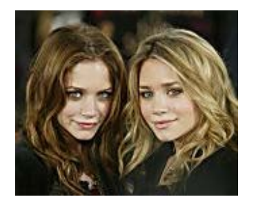
What happened to these former Hollywood 'it' girls? CelebChatter