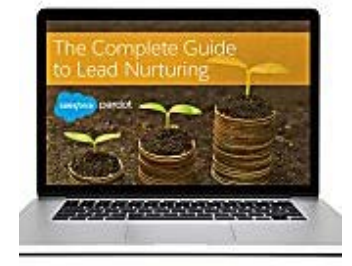
Get the Complete Guide to Drip Marketing Salesforce