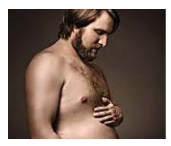
German beer ads show men posing with beer bellies like pregnant w... OddChatter