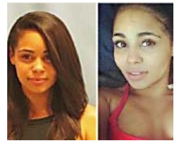
Arrested people continue to go viral because of attractiven... OddChatter