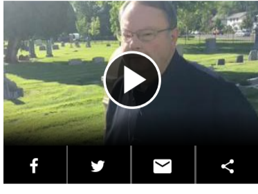
Meet Boise's top cemetery expert