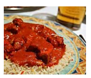
Restaurant owner sentenced to six years in prison after curry dish