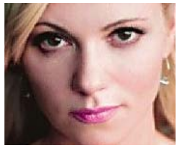
Police track down wanted vegan restaurant owner afte...