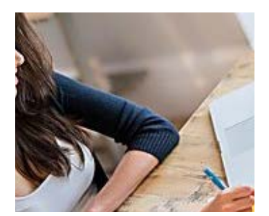
Essential Web Design Skills for Marketers