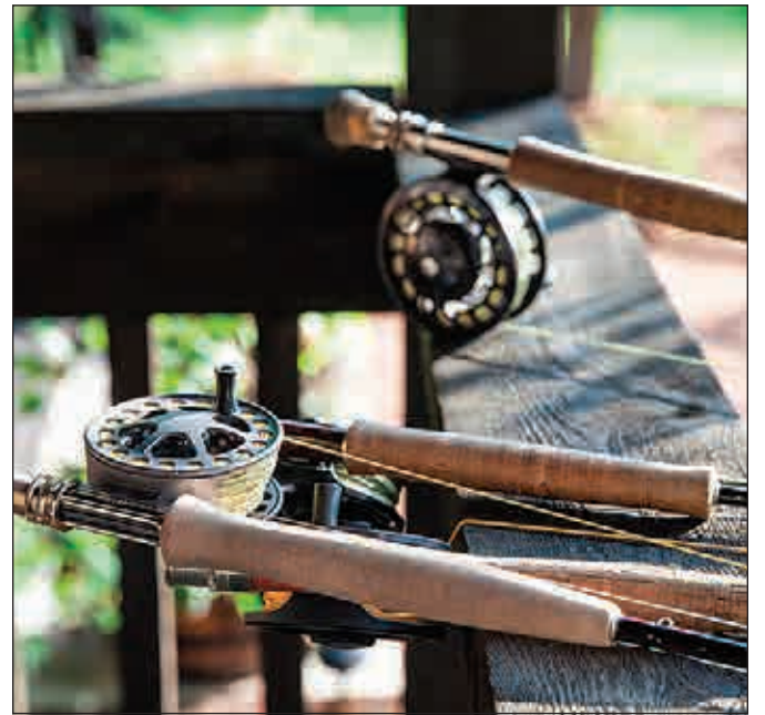
Don't bring your fishing gear. Rods, reels and waders from Patagonia, CF Burkheimer, Echo, Hatch and Spey Co, are available to use, at no charge.