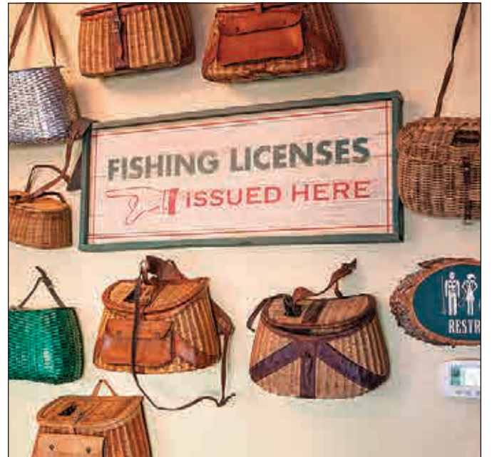
Classic wicker and straw creels help keep caught fish aerated.