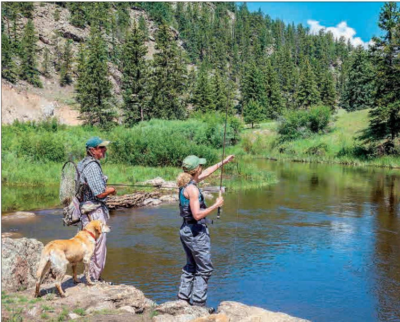
Pools and rapids on the 40-mile-long Tarryall River offer a variety of fishing adventures.