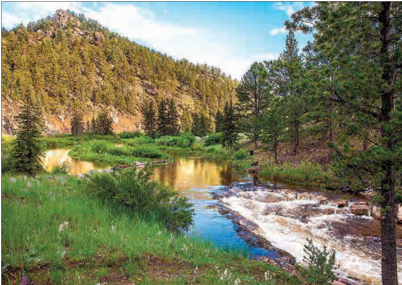
The Tarryall River, flowing through grassy meadows south to low hills and rock formations, meets the South Platte River north of Lake George, Colorado.