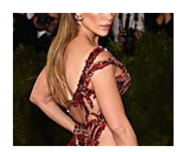
The most memorable looks from Met Gala's past