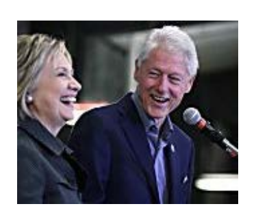
America's political dynasties