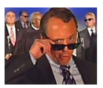
'SNL' mocks GOP with parody of Bears' 'Super Bowl Shuffle'