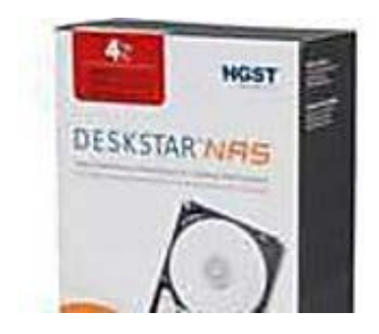
Shop Now - $156.75 $156.75 - newegg.com