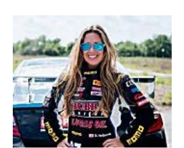
Meet the race car driver some are calling the next Danica Patrick