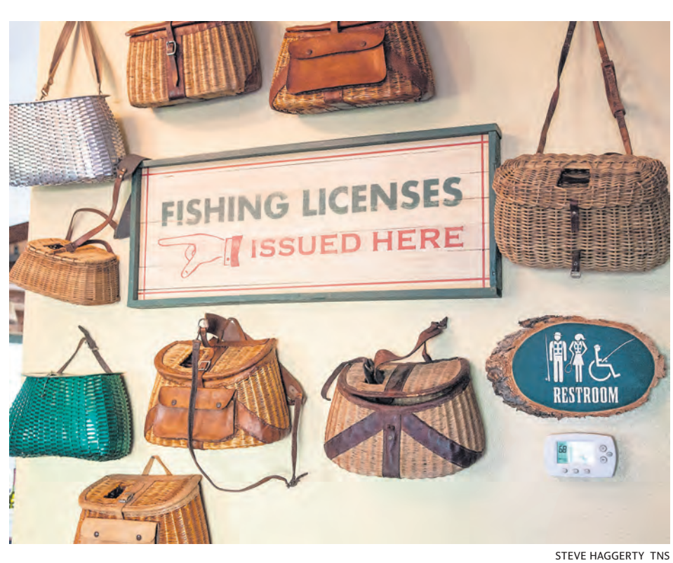
Classic wove wicker and straw creels help to keep caught fish aerated.

ing which fly to use and how to spot the eddies where the trout lurked, fishing wasn't the same.