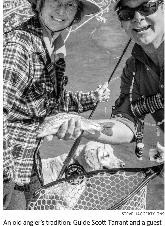
celebrate the first catch of the day.

fish. Bring the family fisherman along, and while he/she is catching dinner, take the car and explore South Park.