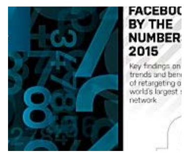
What Is Making B2B Marketers Change Their Minds About Facebook?