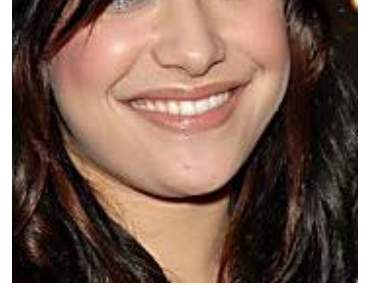
Disney stars who've had run-ins with the law CelebChatter