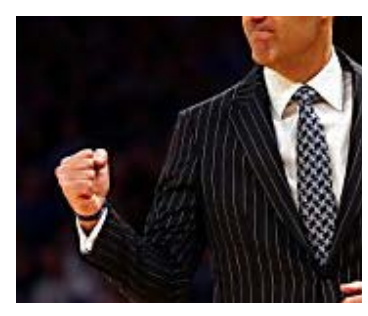
Head coach candidates for the Los Angeles Lakers