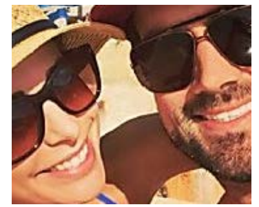
Matt Leinart still living the life despite football failures SportsChatter