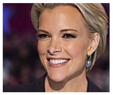
17 facts about FOX News anchor Megyn Kelly PoliticsChatter