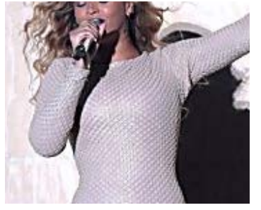
Beyonce's 'Lemonade' and 16 other times singers have trashed t... CelebChatter