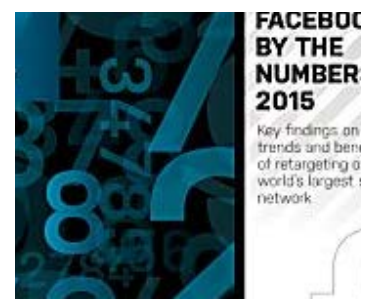
Facebook By The Numbers: World's Largest Social Networ... AdRoll