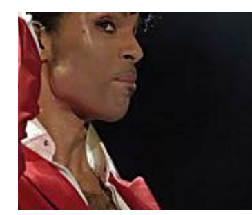
The famous ranks of Jehovah's Witnesses CelebChatter