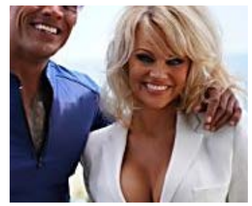
Guess who will be back for the 'Baywatch' reboot CelebChatter