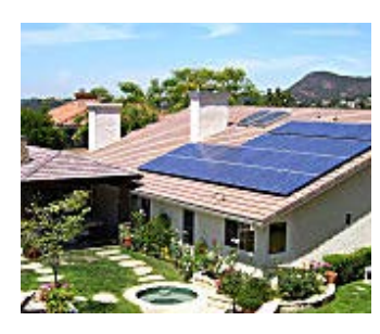
Homeowners Wonder Why No One Talks About New Solar Policy