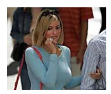
25 Photos That Almost Broke The Internet LifeHackLane